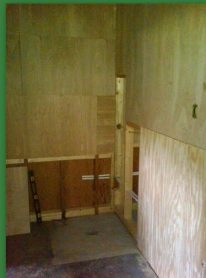
Cabin 7 – Phase 2 Shower Renovations Underway