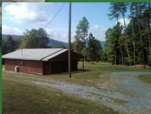
Lower: Land Clearing Complete

Special thanks to our many volunteers and donors who made these projects possible. For more info on projects around Bluestone, see the 2011 donor funded project expense report,