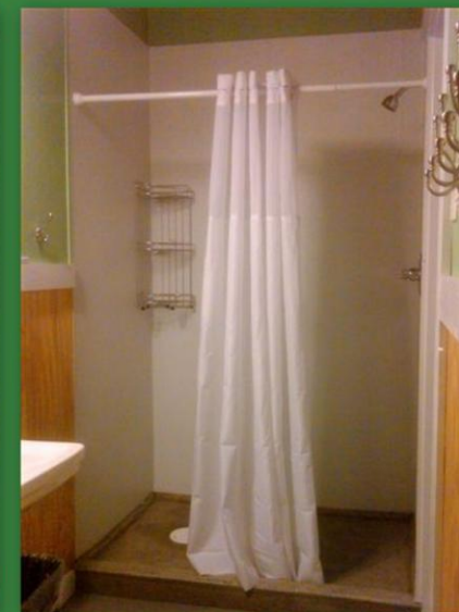
Cabin 6 – Phase 2 Shower Renovations Complete