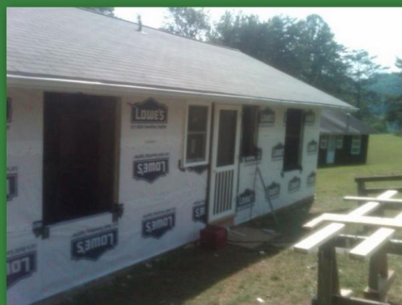
Cabin 15 Renovations