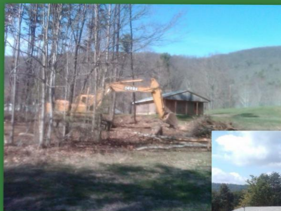
Upper: Land Clearing in Action