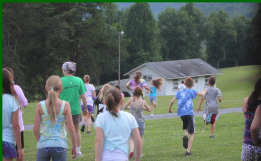
Summer Camp 2011 Theme – The Jesus Creed: Love the Lord your God with all your heart and with all your soul and with all your mind. This is the first and greatest commandment. And the second is: Love your neighbor as yourself. All the Law and the Prophets hang on these two commandments. Matthew 22:37-40